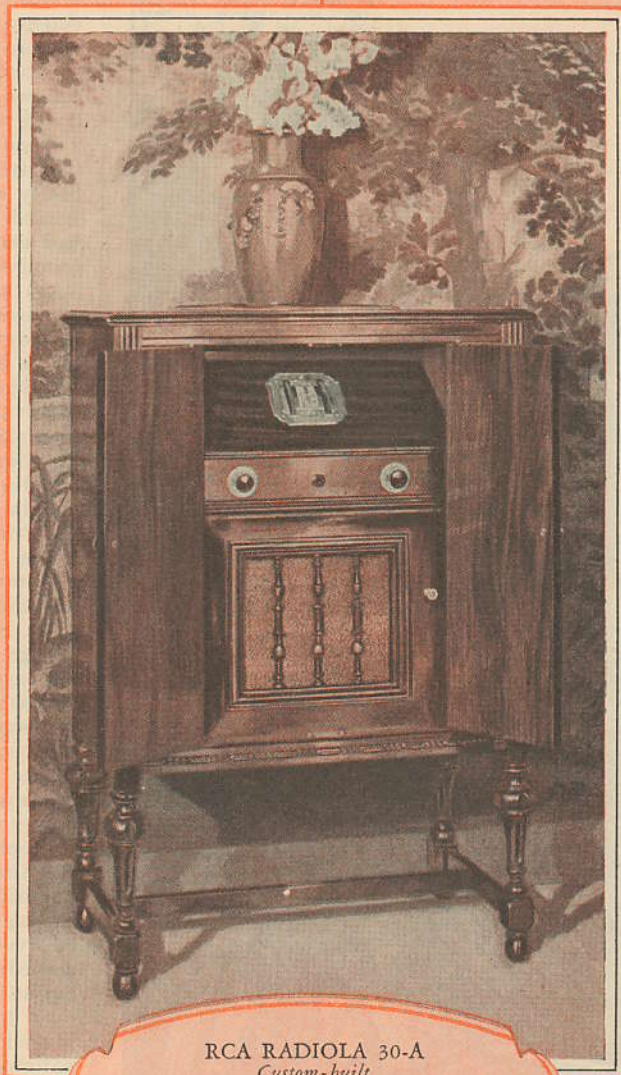
RCA RADIOLA 30-A Custom-built

RCA Loudspeaker 104 (A.C.) $275 RCA Loudspeaker 104 (D.C.) $310